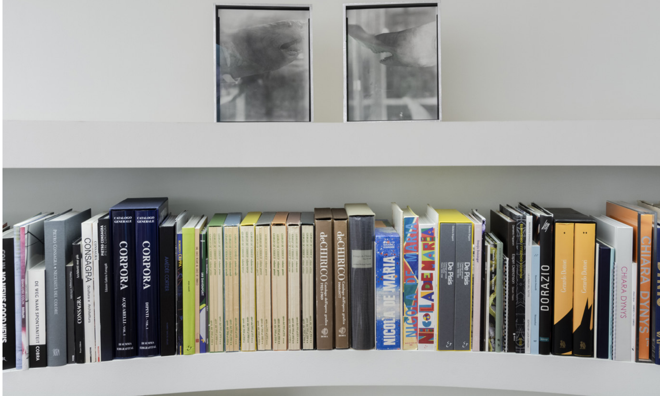
Squalo limone, Squalo martello , 2021, two gelatin silver contact prints and handmade aluminium tape frames, 20 x 25 cm each