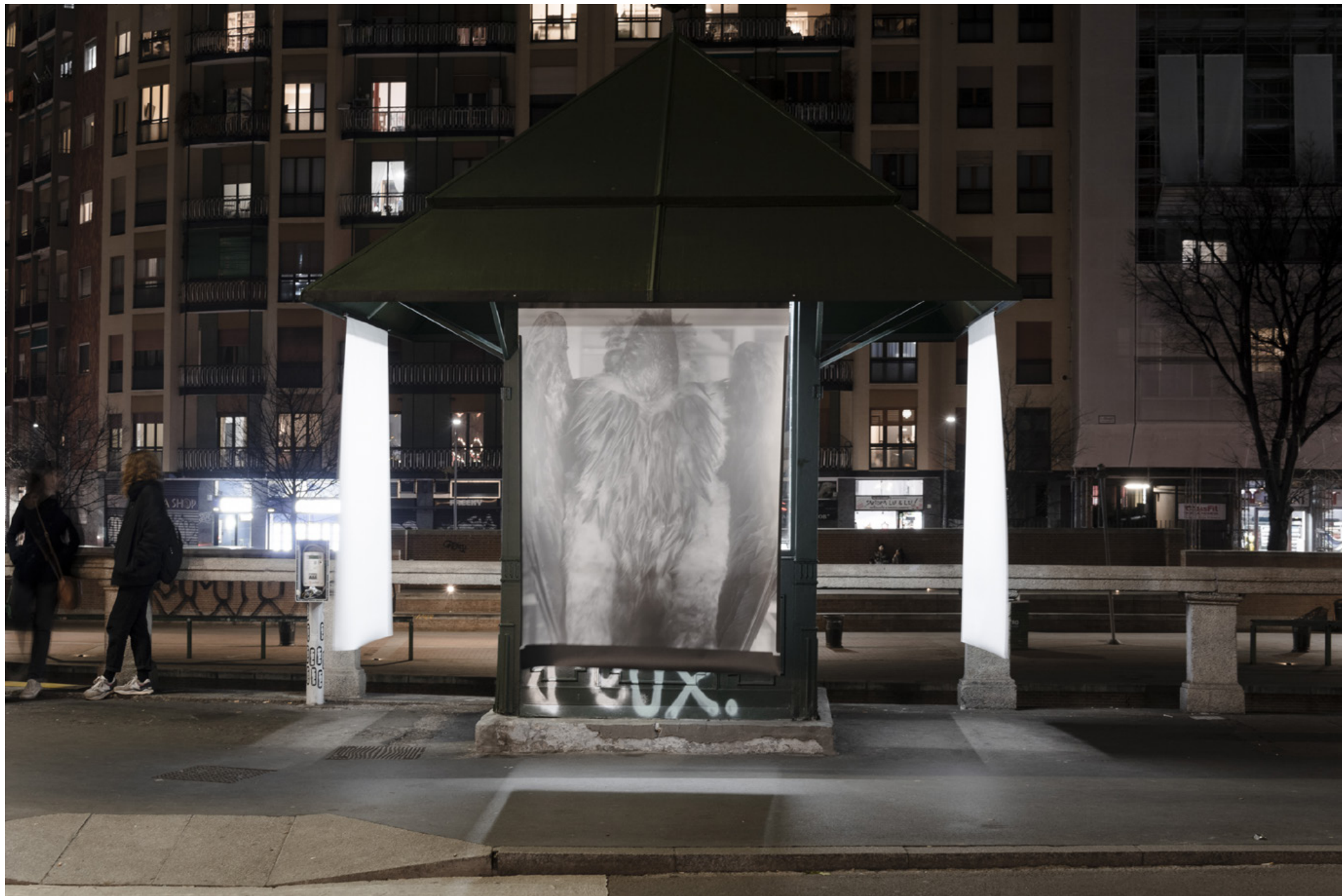
UV print on airtex, 180 x 140 cm from 20 x 25 cm film, installation view, Edicola Radetzky