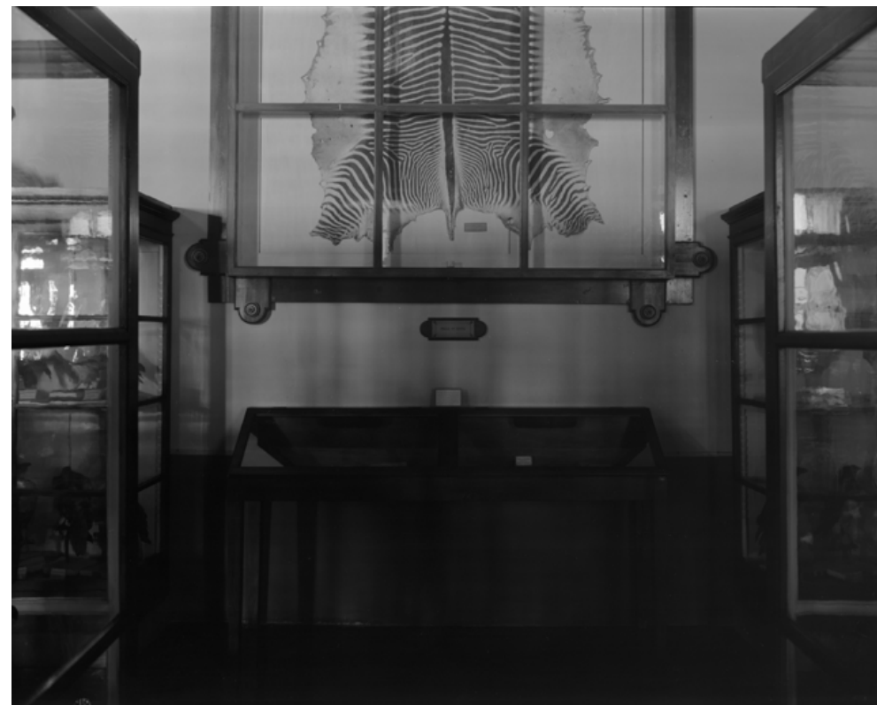
Ritaglio 1, Ritaglio2, Tentativo, 2021, gelatin silver contact print, 20 x 25 cm each