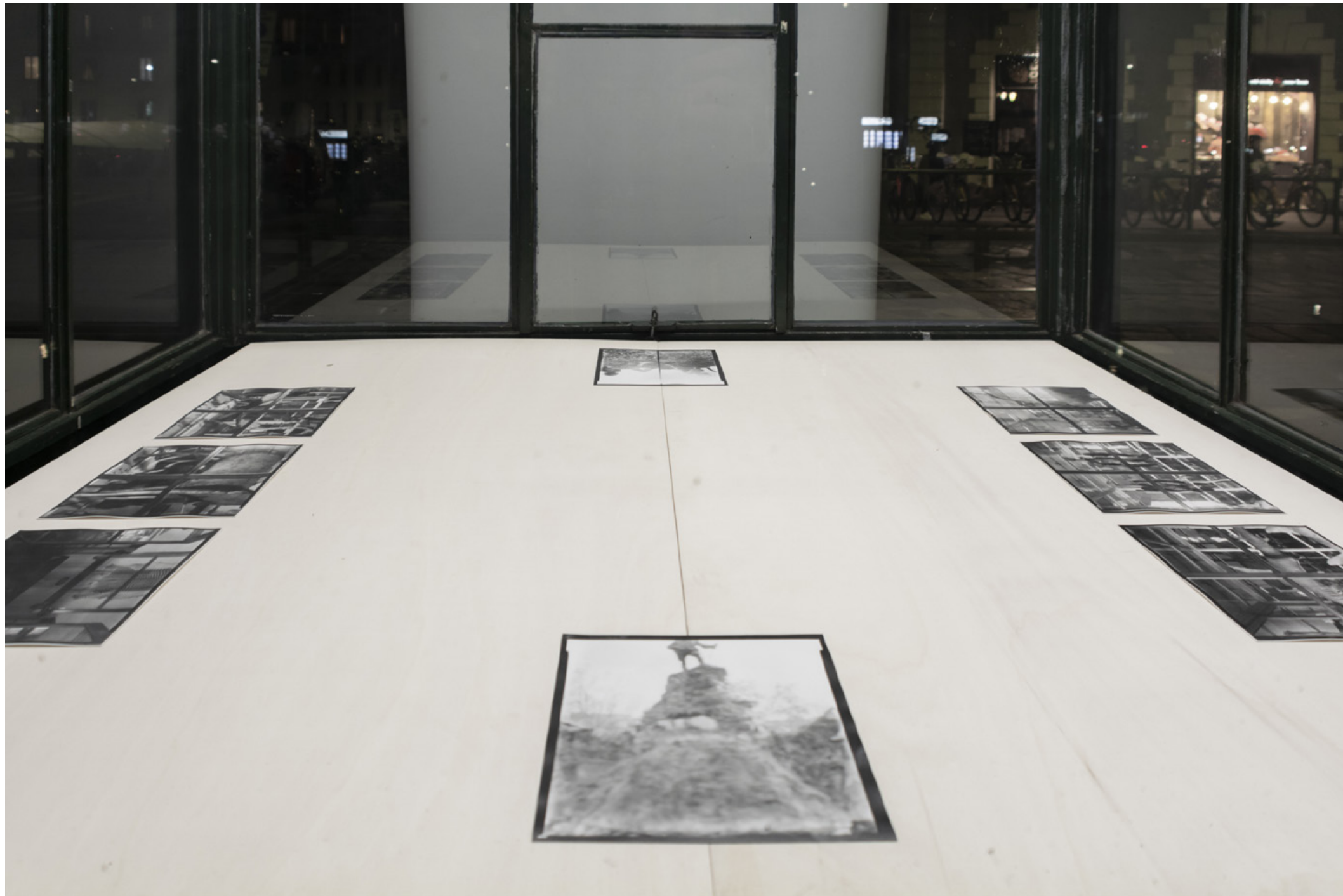
Gelatin silver contact prints, 20 x 25 cm each, installation view, Edicola Radetzky