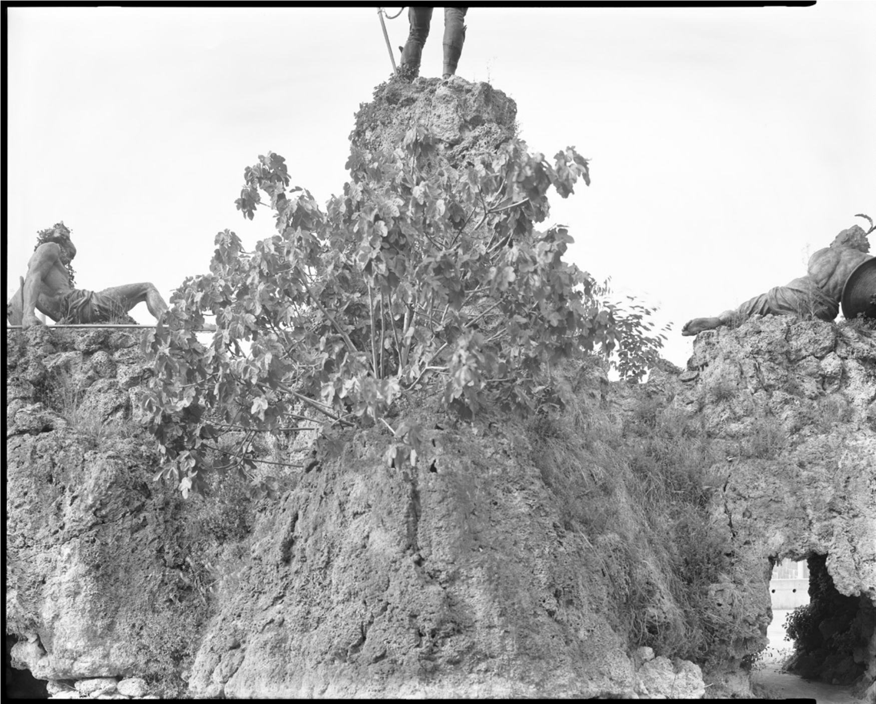
Distanza , 2020 - 2021, gelatin silver print, contact print, 25 x 20 cm