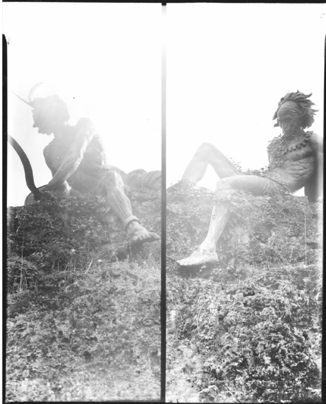
Dialogo , 2020 - 2021, gelatin silver print, contact print, 25 x 20 cm