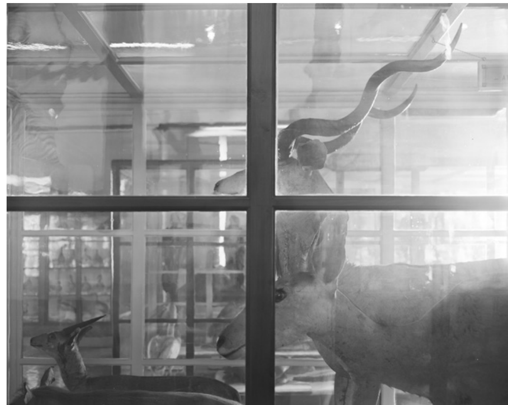
Frontale 1, Frontale 2, Frontale 3, 2021, gelatin silver contact print, 20 x 25 cm each