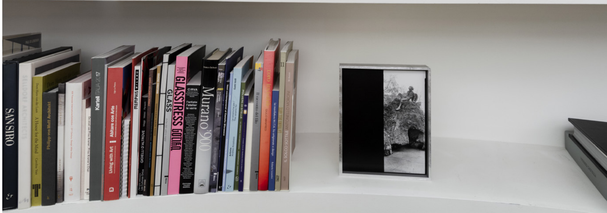
Distanza , 2020 - 2021, gelatin silver print, two contact prints and handmade aluminium tape frames, 20 x 25 cm each