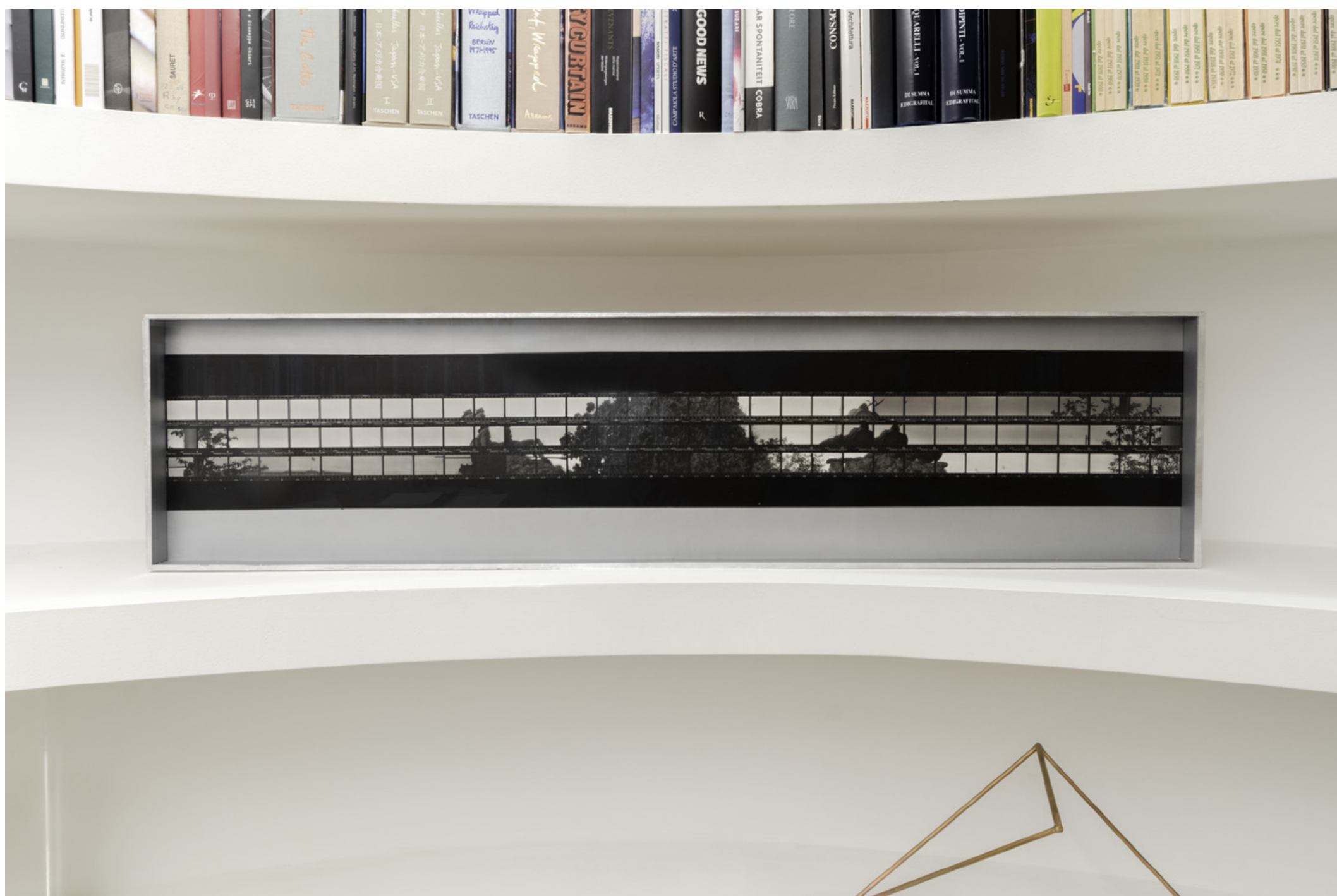
Panorama , 2020 - 2021, gelatin silver contact print of three 35 mm roll films, handmade aluminium tape frames, total size 130 x 30 cm