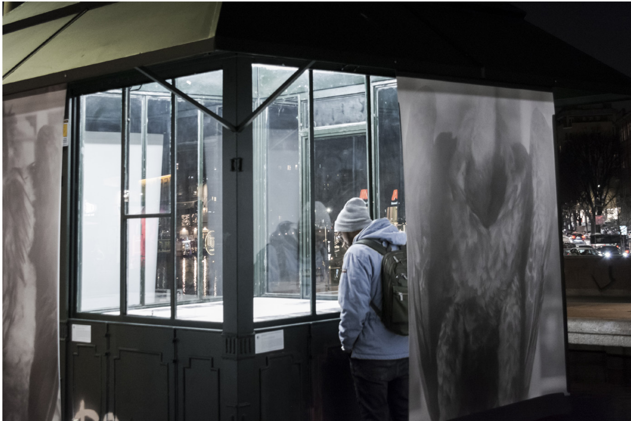
Installation view, Edicola Radetzky