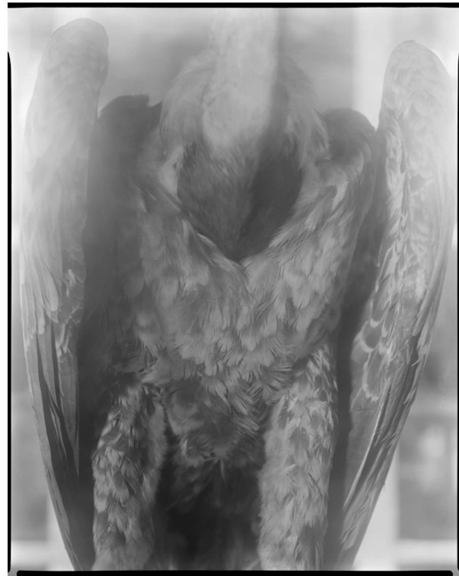
Gipeto Barbatus, Grifone di Rüppell, Avvoltoio orecchiuto, 2021, UV print on airtex, each