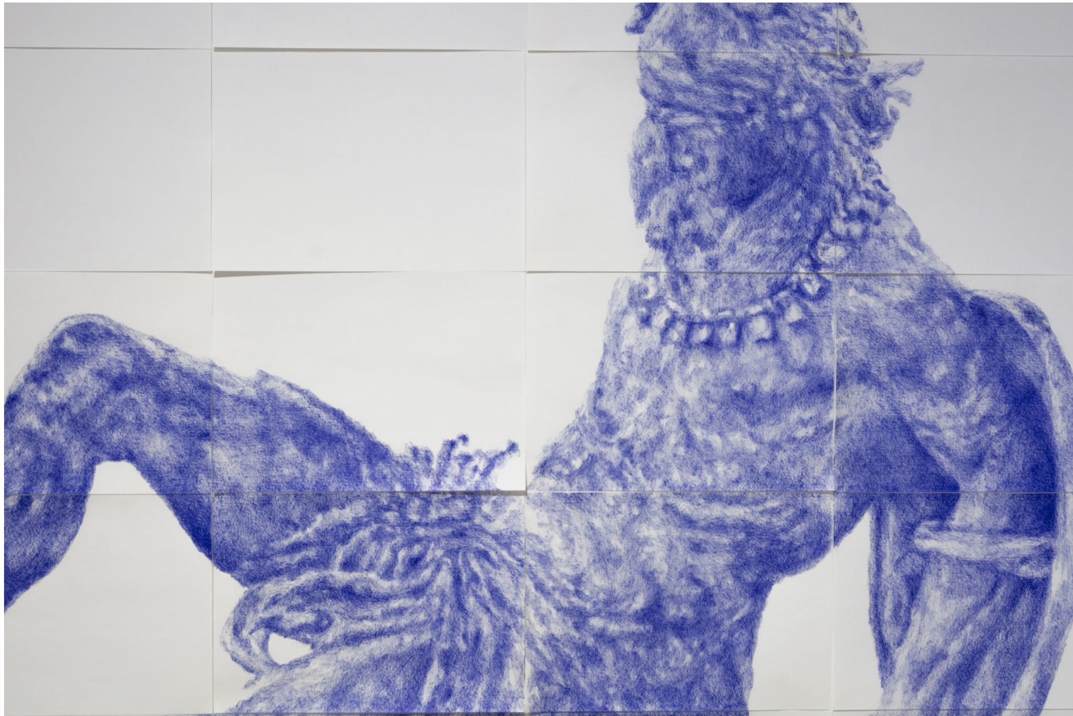
Giuba, 2020 - 2021, blue pen on 56 A4 paper as total, environmental size