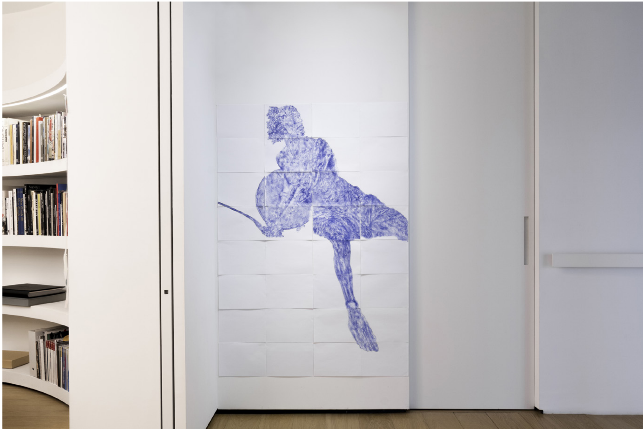
Omo , 2020 - 2021, blue pen on 56 A4 paper in total, environmental size