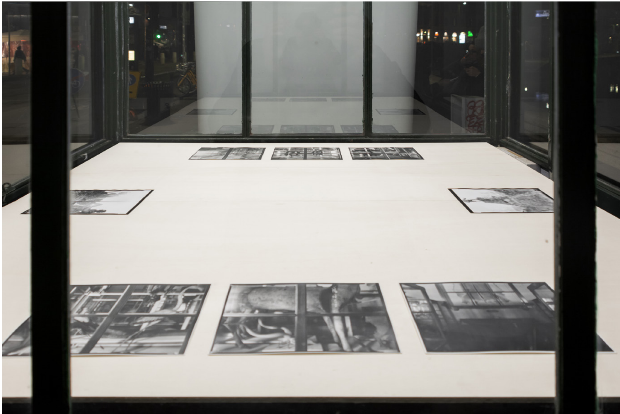
Gelatin silver contact prints, 20 x 25 cm each, installation view, Edicola Radetzky